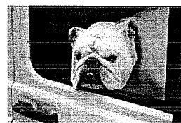
Looking for an online quote ?

Insurance companies will generally insure homeowners with dogs, but with certain limitations. If you own a breed that has been historically violent or unpredictable, you may have to pay an increased premium even if your dog has never shown a propensity toward biting. Some companies will lower this fee if the dog has passed an accredited obedience school.